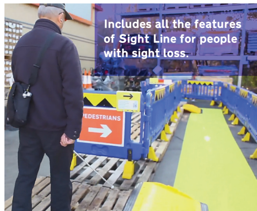
In this image taken from our video demonstration (available on request), barriers on the left were raised with pallets to represent kerb height and kerb ramp positioning.

Accessed through native apps on iOS and Android or a web app