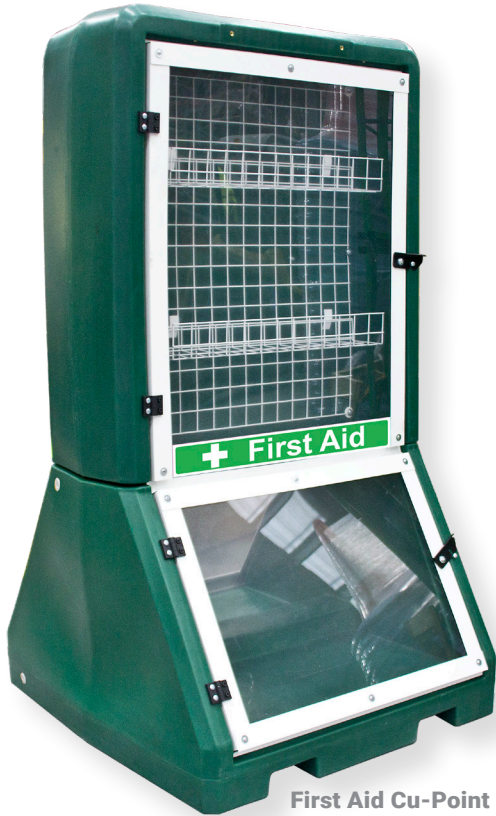
First Aid Cu-Point Code: CUPTFA