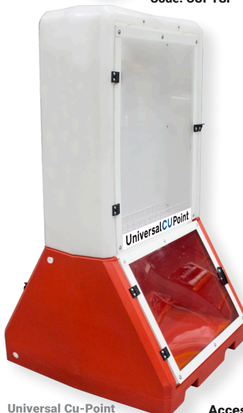
Universal Cu-Point Code: CUPTUV