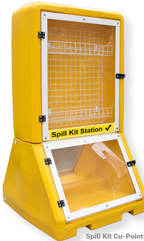
Spill Kit Cu-Point Code: CUPTSP