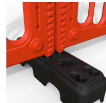
Centre Holes Back