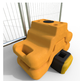
Shown in place 2 up